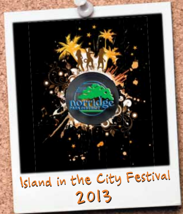
Island in the City Festival 2013